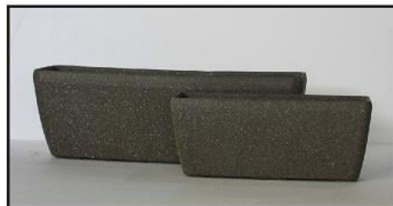
AUTUMN BROWN SL7067AB