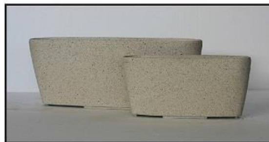
SPARKING WHITE SL7067AB